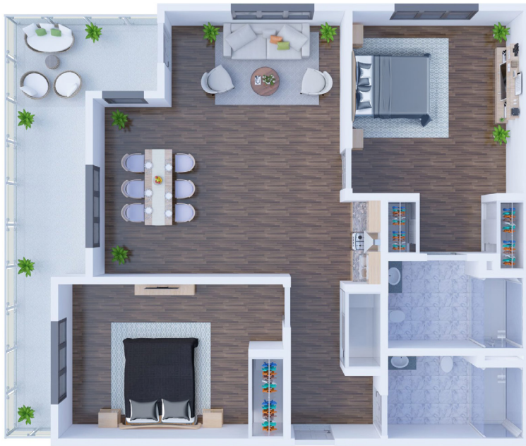
C2 Two Bedroom 937 SQ FT