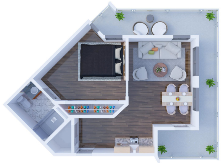
B10 One Bedroom 546 SQ FT

Solstice at Kennewick 8264 West Grandridge Boulevard | Kennewick, WA 99336 844.837.2993 SolsticeAtKennewick.com