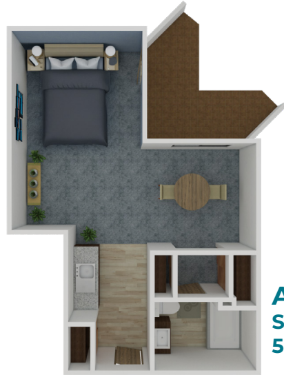
A6 Studio 518 SQ FT