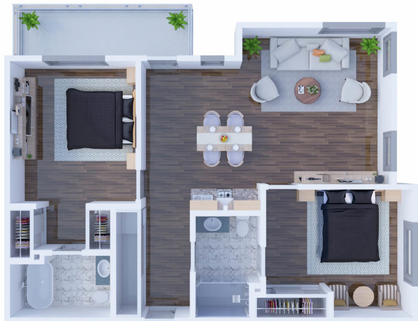
C4 Two Bedroom 975 SQ FT