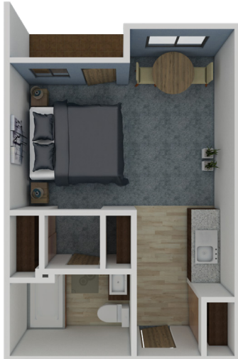
A1 Studio 404 SQ FT

Solstice at Kennewick offers several floor plan choices to suit your needs.