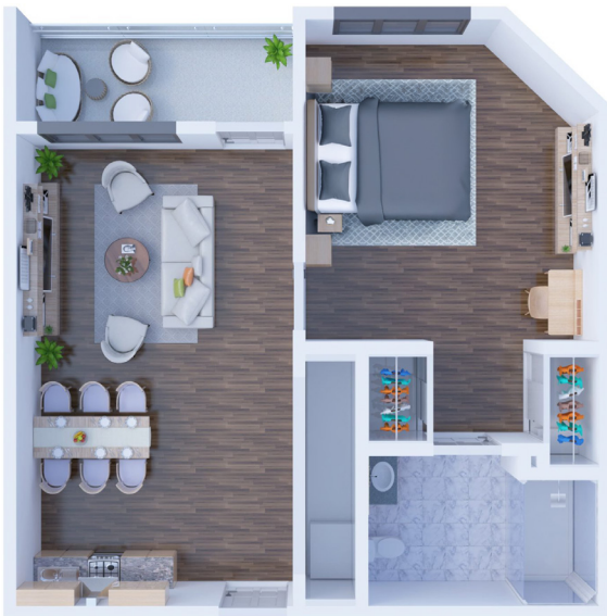
B5 One Bedroom 542 SQ FT