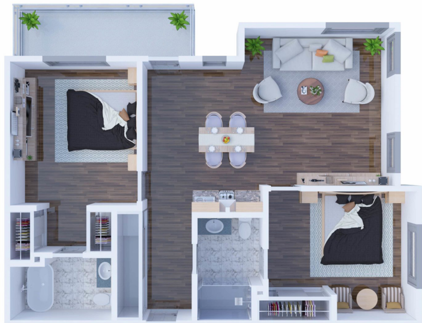
C4 Two Bedroom 975 SQ FT