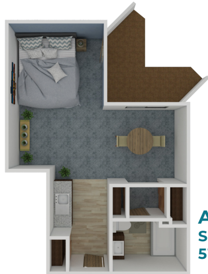
A6 Studio 518 SQ FT