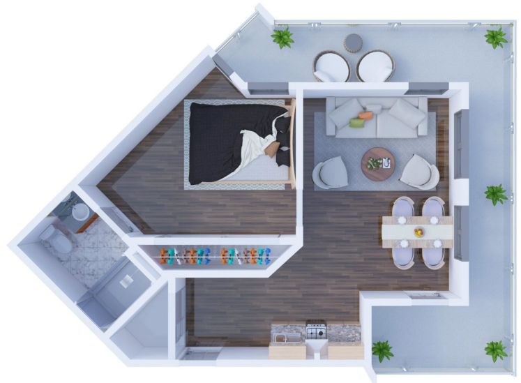
B10 One Bedroom 546 SQ FT

Solstice Senior Living at Kennewick 8264 W. Grandridge Boulevard, Kennewick, WA 99336 (844) 837-2993 SolsticeSeniorLivingKennewick.com