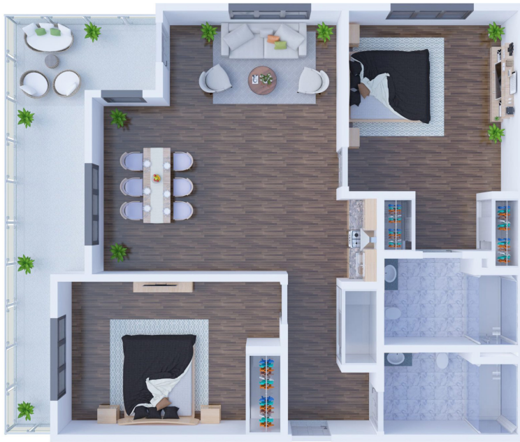
C2 Two Bedroom 937 SQ FT