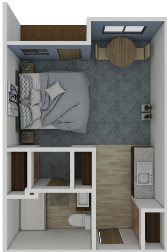
A1 Studio 404 SQ FT

Solstice Senior Living at Kennewick offers several floor plan choices to suit your needs.