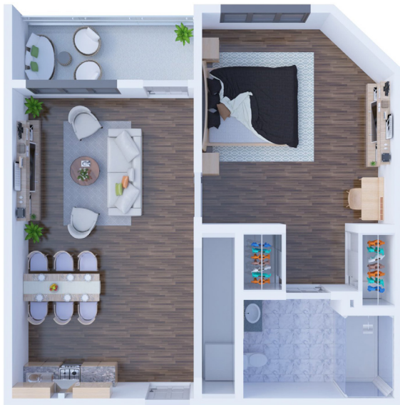
B5 One Bedroom 542 SQ FT